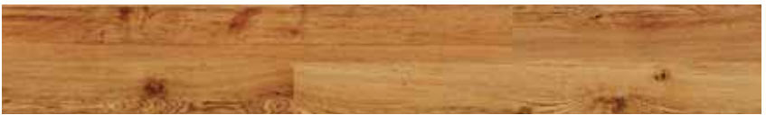
American Oak WLP6411/WLL6411