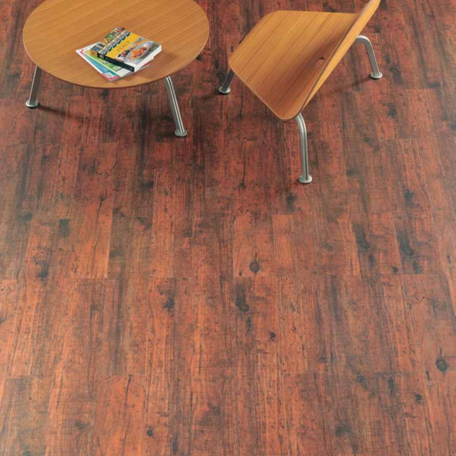
Contemporary collection, Oiled Redwood, DFWS721. Front cover: Classic collection, American Oak, WLP6411