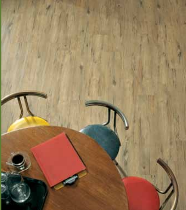
Decora collection, Hickory, DW1160.