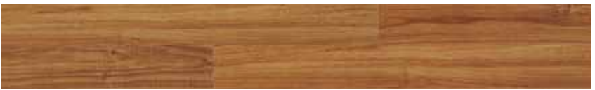
Select Walnut WLP6512/WLL6512