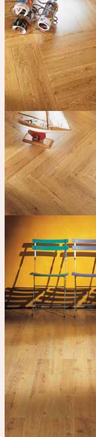
All photographs left, Classic collection, American Oak, WIP6411. For left, Classic collection, Select Walnut, WIP6512.